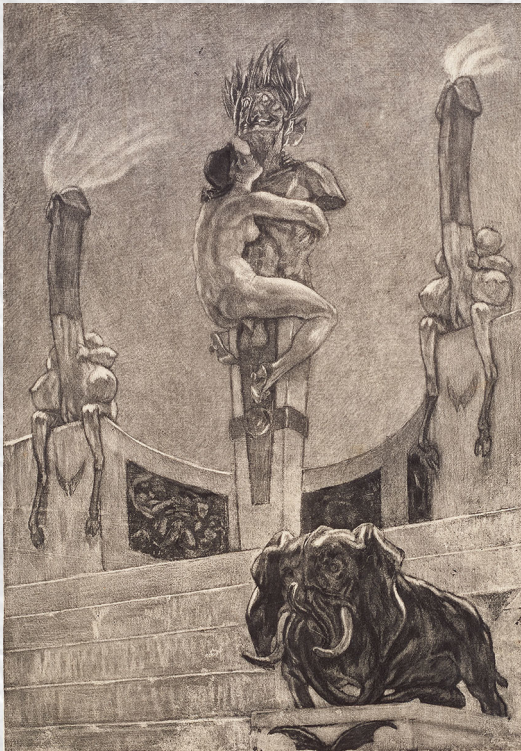
Félicien Rops, L'idole (1882)