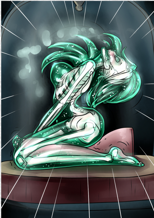
Dark Erotic Art: A page from "Gel Girl Genesis," a graphic story written by Faustus and illustrated by ICUDhara

principle dark erotic art might be created in any medium and of course we would welcome composers, choreographers, sculptors, dramatists, filmmakers or video-game designers, anyone! We would also be interested in interviewing critics and curators of dark erotic art.